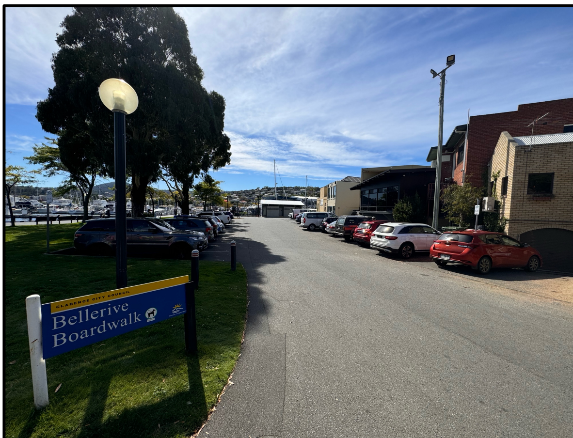
Bellerive Boardwalk carpark

When I arrive, I can park in either the Bellerive Yacht Club carpark accessible via Cambridge Road or the Bellerive Boardwalk carpark. There is also street parking available in the area.