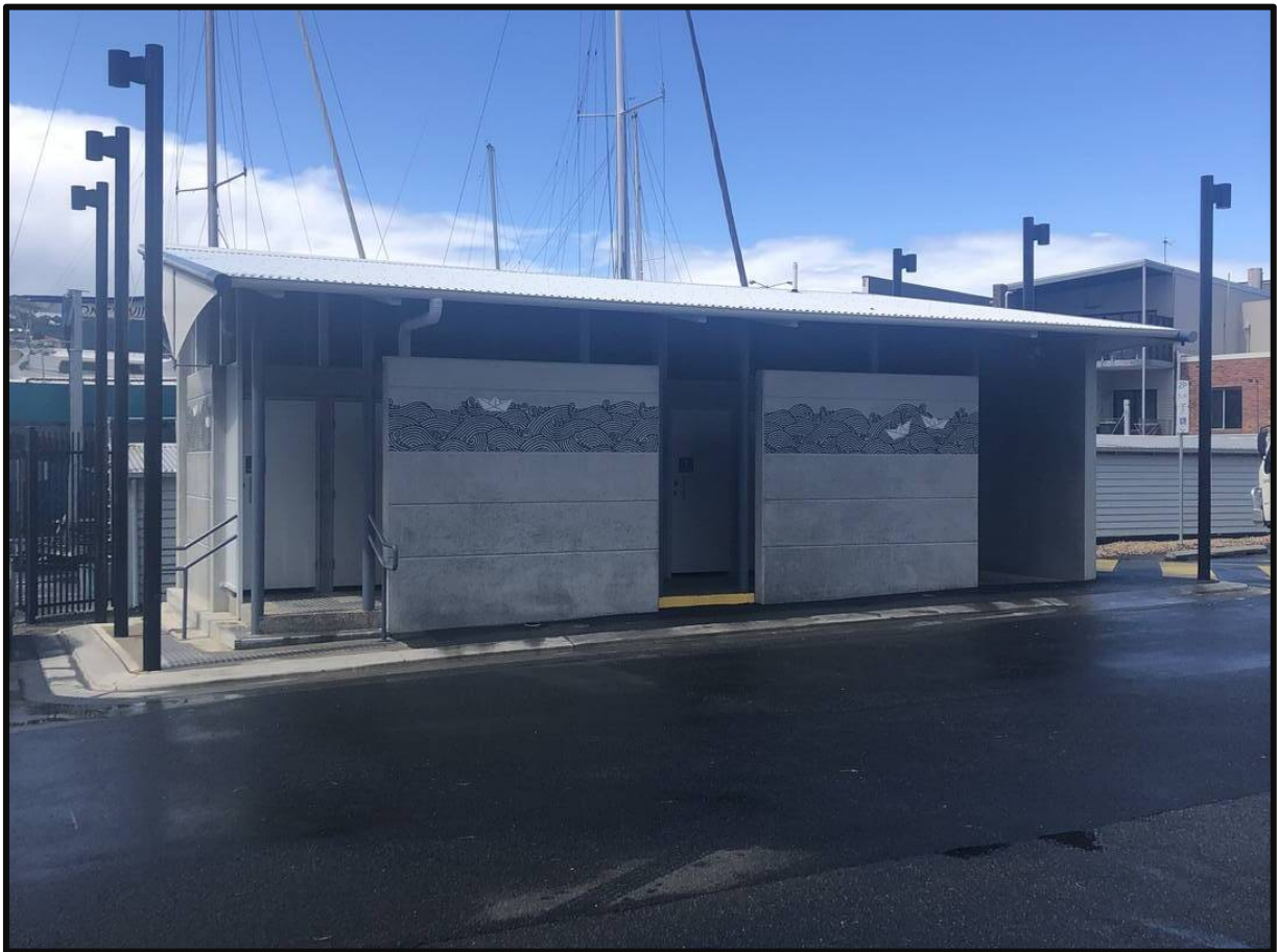
Public bathroom at the end of the Boardwalk carpark

If I need to use the bathroom, there is a public bathroom located next to the Bellerive Boardwalk carpark. This is a gender-neutral and accessible bathroom.